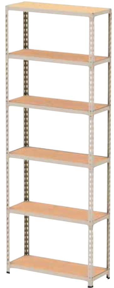
Loading capacity (Lbs.) per Bay.