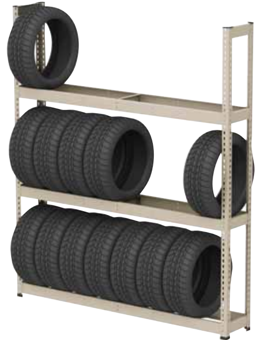
Loading (Lbs.) per shelf (UDL). Shelves with particle board panels 5/8" thickness